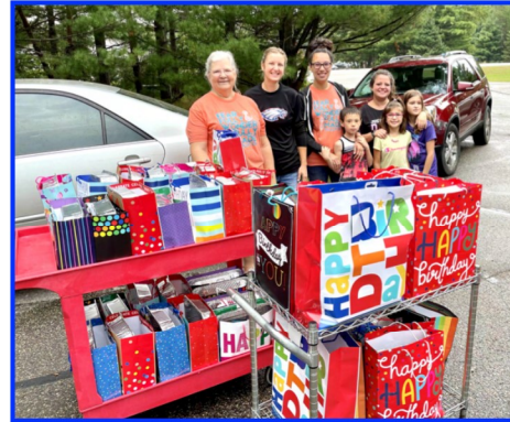
Pequot Lakes Baptist Church Donates Birthday Bags